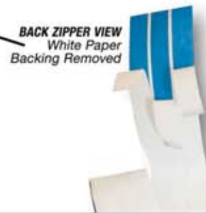
BACK ZIPPER VIEW White Paper Backing Removed