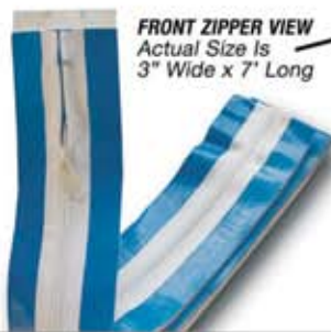
FRONT ZIPPER VIEW Actual Size Is 3" Wide x 7' Long